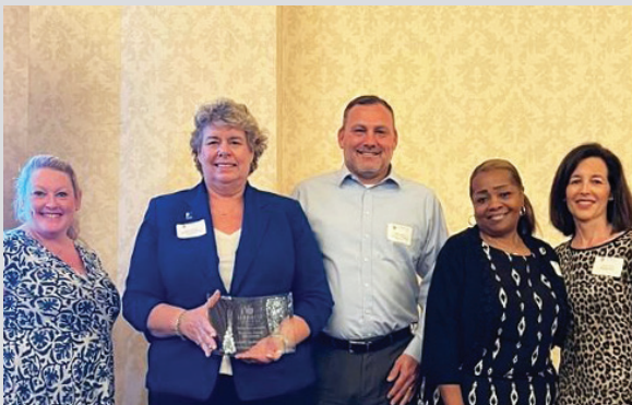
Jefferson Chamber of Commerce, LiveWell Jefferson Healthy Business Award for Creative DEI Program